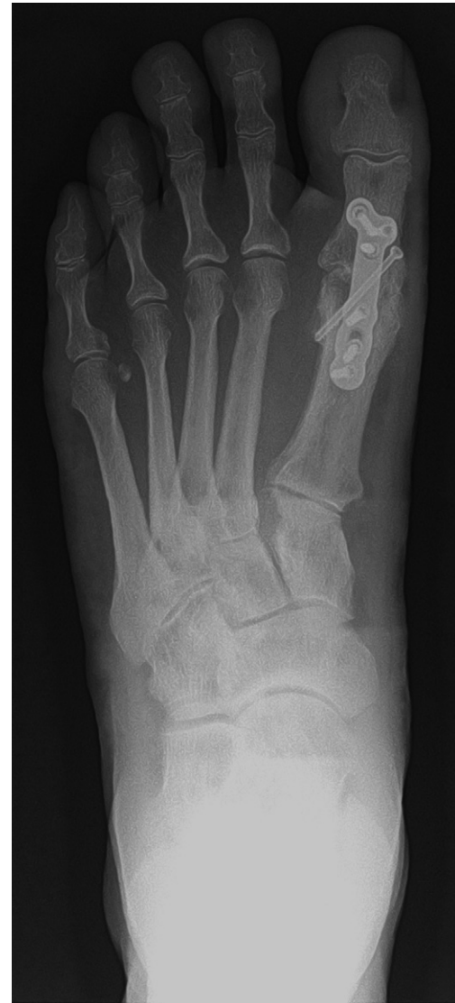
Fig. 1. Arthrodesis. Postoperative dorsal-plantar radiographic view demonstrating result of arthrodesis of first metatarsophalangeal joint using a plate and a single partially threaded cortical lag screw.

Robust long-term studies examining the efficacy for the surgical treatment of end-stage hallux rigidus are lacking. There are conflicting and unclear published reports regarding arthrodesis, hemi-implant arthroplasty, and resectional arthroplasty. To our knowledge, no large, long-term published outcome studies have directly compared these 3 surgical techniques. The present study was a multicenter, retrospective, comparative study examining the