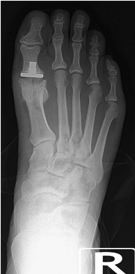
Fig. 2. Hemi-implant arthroplasty. Postoperative dorsal-plantar radiographic view demonstrating result of hemi-implant arthroplasty of first metatarsophalangeal joint.