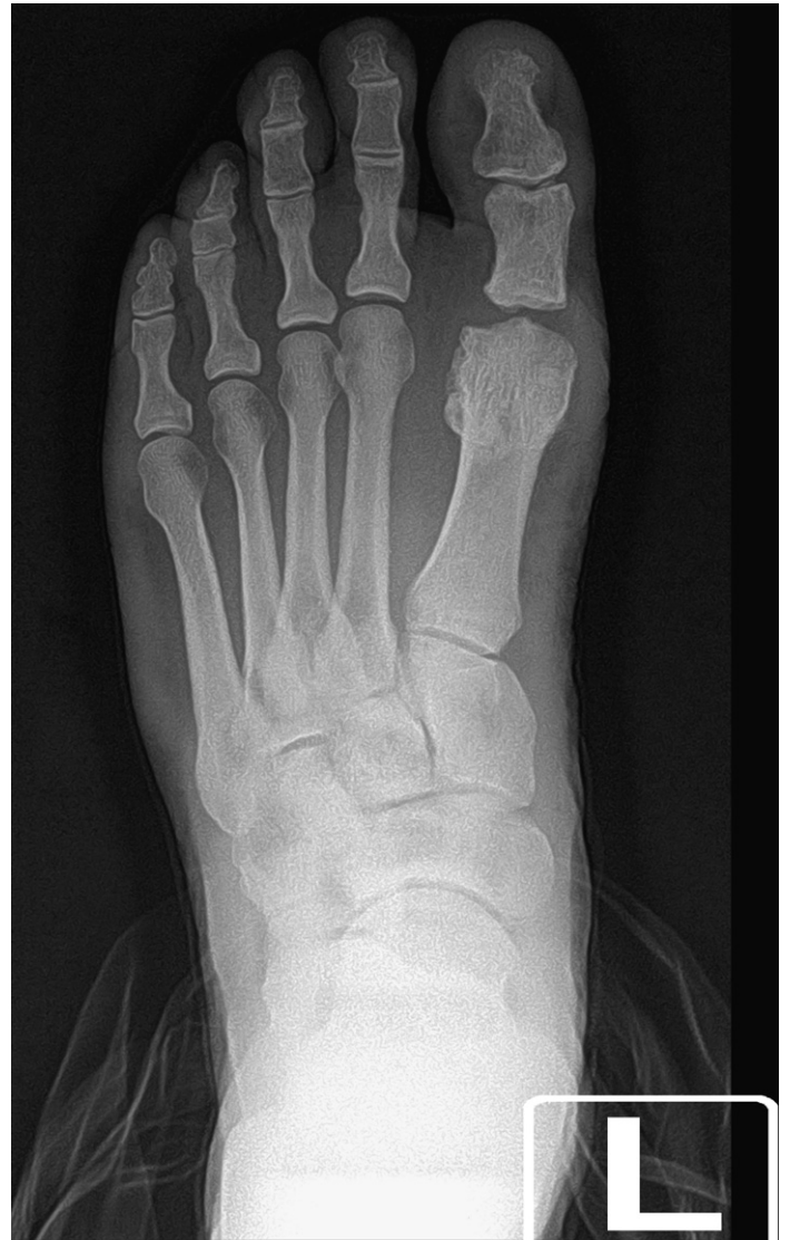
Fig. 3. Resectional arthroplasty. Postoperative dorsal-plantar radiographic view demonstrating result of resectional arthroplasty of first metatarsophalangeal joint.

withdrawn because of the lack of study progress and subject enrollment. The other site was withdrawn because multiple pages of data were either not collected or missing. The data collected from these sites were not used in the final analysis. Two replacement sites were added according to the same criteria as listed. After an interim power analysis was conducted, an additional investigational site was added to increase the power of the study. Hence, the data from 6 sites were used for the final statistical analysis.